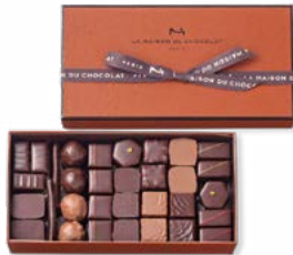
Coffret Maison 465g, assorted 400 POINTS