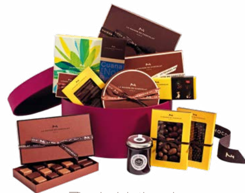
Zinnia Hatbox* 12 products 800 POINTS