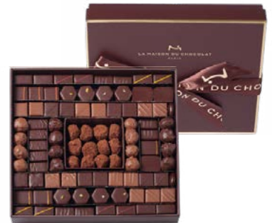
Boîte Maison 93 pieces 500 POINTS