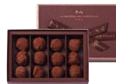
Plain Dark Truffles Gift Box 12 pieces 100 POINTS