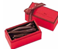
Orangettes Gift Box 12 pieces 75 POINTS