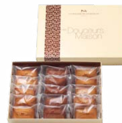
Financier Gift Box 15 pieces 150 POINTS