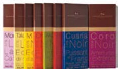
Chocolate Bar 1 piece 50 POINTS