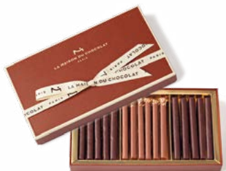
Twigs Gift Box 16 pieces 150 POINTS