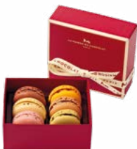
Macaron Gift Box 6 pieces 75 POINTS