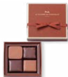
Pralines Gift Box 4 pieces 50 POINTS