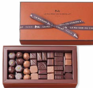
Coffret Maison 795g, assorted 500 POINTS