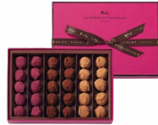
Flavoured Truffles Gift Box 30 pieces 200 POINTS