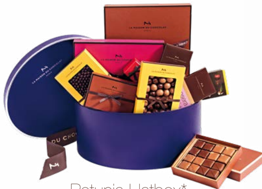
Petunia Hatbox* 10 products 600 POINTS