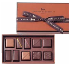
Gesture Gift Box 10 pieces 100 POINTS