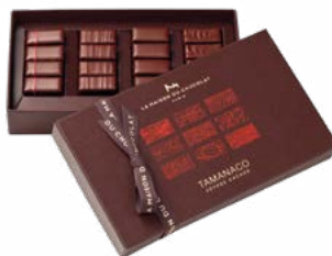
Coffret Tamanaco 16 pieces 150 POINTS