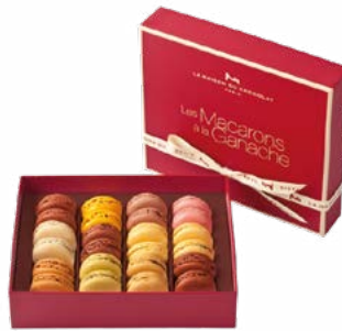
Macaron Gift Box 24 pieces 200 POINTS