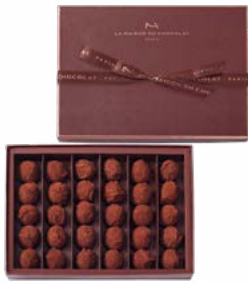
Plain Dark Truffles Gift Box 30 pieces 200 POINTS